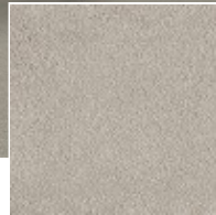
230 / Sweet Elegance / Flax