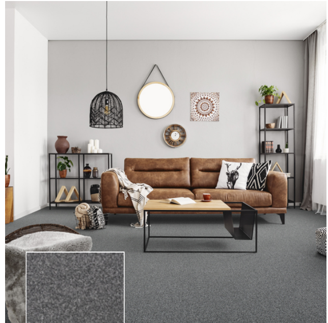
810 / Fairfield Silk - Silk Elite / Charcoal

Secondary backing: SB Quality code: FFS/FSE Manufacturing process: Tufted Pile composition: Eccelena