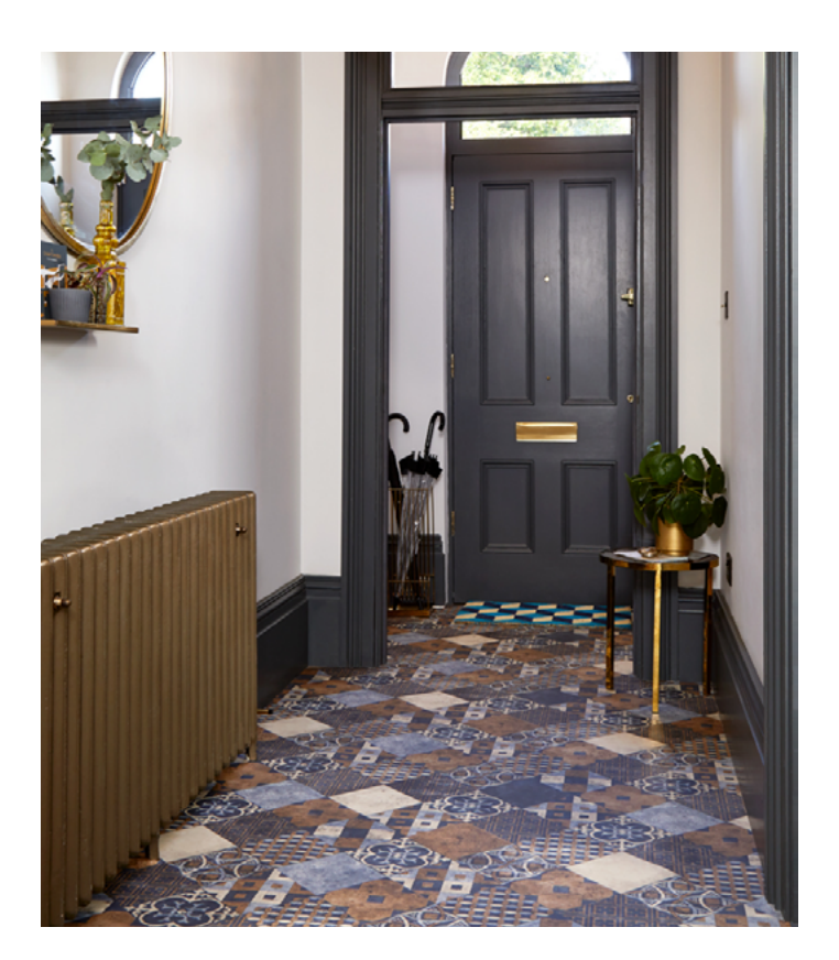
Harlem Iconic - Leonardo Indigo

We often find our retailer and fitters prefer textile backed vinyl, as they know customers are usually very happy with their choice.