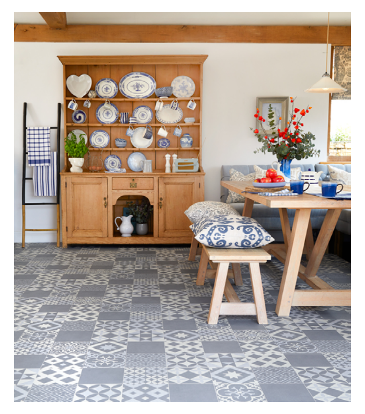
Baroque - Amadora Chalk

Although vinyl floors are waterproof from above, this does mean that liquids can puddle on the surface. Any puddles should be cleaned up promptly to avoid slip hazards, as well as water marks. If you do end up with a stain, warm water and soap is usually enough to remove it.