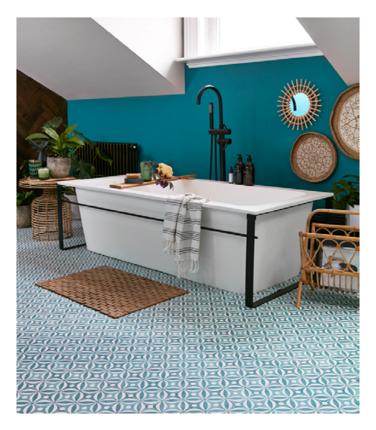
Kansas - Bronson Vibrant

• A hardwearing, clear wear layer - The main wear layer that protects your floor, meaning it can stay looking great even through the demands of a busy, demanding home