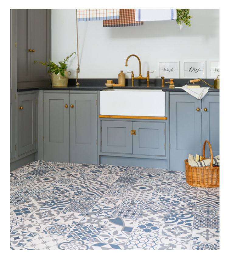
Lincoln - Belmont

Always check that any products you use are safe for vinyl floors, and that they are suitable for use with children or pets if you have these in your home. No matter how tempting it might be, never use abrasive scourers on your vinyl floor as these could cause permanent damage to the surface. Harsh solvents such as acetone or lacquer thinner should also be avoided as they can