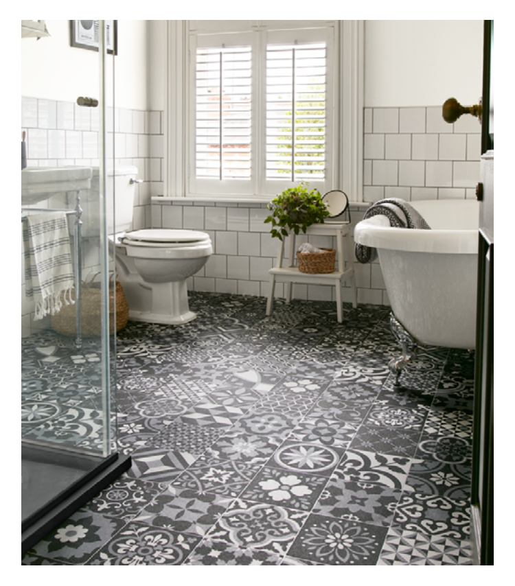
Miami - Nightlife

A great value, affordable and hardwearing option, vinyl is available in almost any design or pattern, from natural wood- and stone-effect finishes to unusual, innovative and quirky designs, perfect for creating a statement floor.