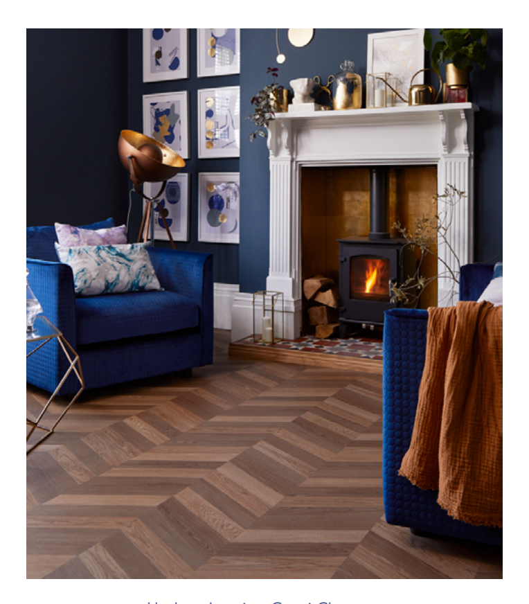
Harlem Iconic - Capri Chevron

If you are installing vinyl in a bathroom, it's important to check the slip resistance rating is rated R10 or higher. This will begin with an R (known in the industry as a Ramp Test) and shows how slippery a floorcovering will be when wet.