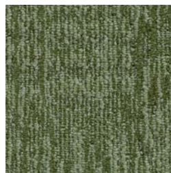
22218 alpine LRV: Y 15.16