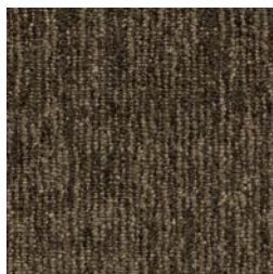
22214 cabin LRV: Y 6.05