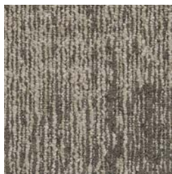
22209 husky LRV: Y 14.79