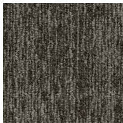
22210 wolf LRV: Y 7.41