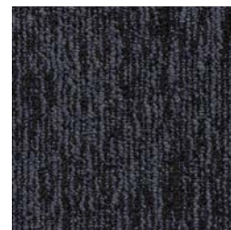
22207 creek LRV: Y 2.73