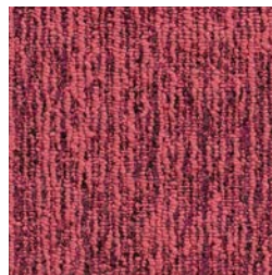
22217 wildflower LRV: Y 9.05