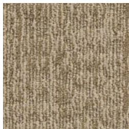
22213 antler LRV: Y 23.07