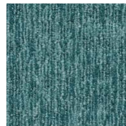
22220 lagoon LRV: Y 8.30