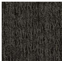
22205 moose LRV: Y 3.24