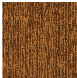
22216 amber LRV: Y 7.71