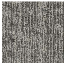
22201 ice LRV: Y 14.80