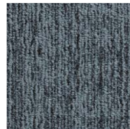
22208 lake LRV: Y 7.10