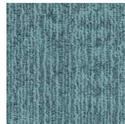
22219 rapids LRV: Y 15.77