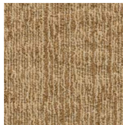
22215 maple LRV: Y 24.28