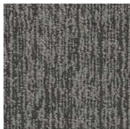
22202 ridge LRV: Y 10.09